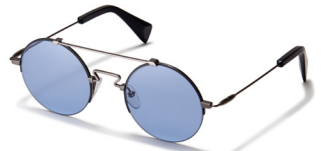
002 MATTE BLACK