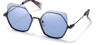
031 MATTE BLACK