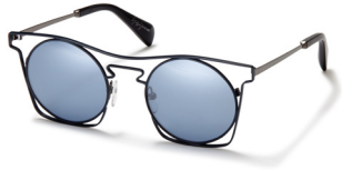
002 MATTE BLACK