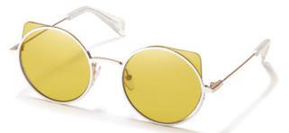
002 MATTE BLACK