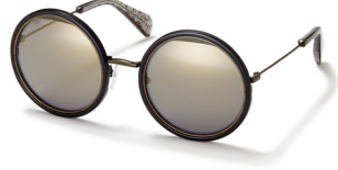
002 MATTE BLACK