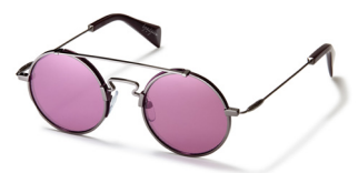
479 GOLD / BLACK