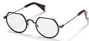
004 MATTE BLACK